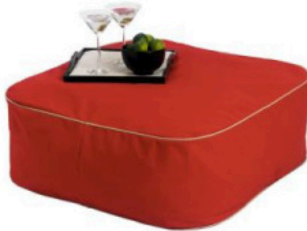
Marine Bean Ottoman in Red