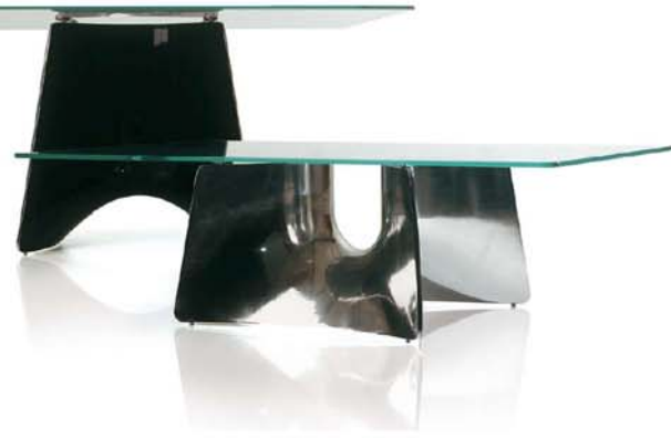
TABLE AND COFFEE-TABLE WITH BASE STRUCTURE IN CAST ALUMINIUM AND ROUND, SQUARE, RECTANGULAR OR ELLIPTICAL 10MM EXTRACLEAR TEMPERED GLASS TOPS, FIRMLY CONNECTED TO THE STRUCTURE THROUGH AN INNOVATIVE MECHANICAL SYSTEM. BENTZ IS AVAILABLE IN FOUR FINISHES: POLISHED OR PAINTED IN WHITE, RED OR BLACK. THE BASES CAN ALSO BE BOUGHT SEPARATELY.